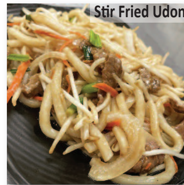
Stir Fried Udon