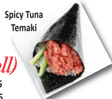
Spicy Tuna Temaki