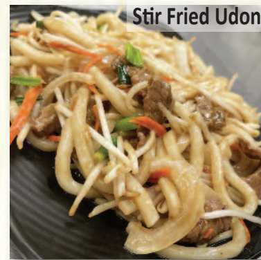
Stir Fried Udon