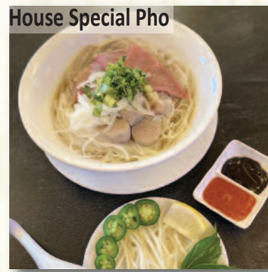
House Special Pho