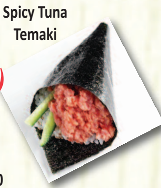
Spicy Tuna Temaki