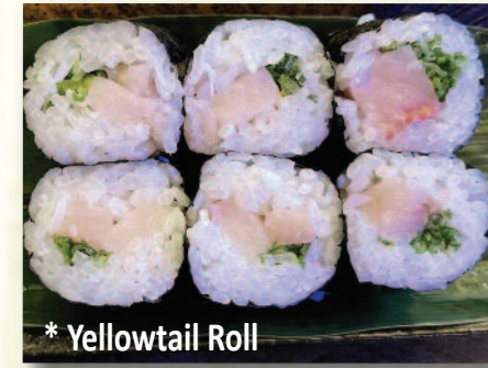
* Yellowtail Roll